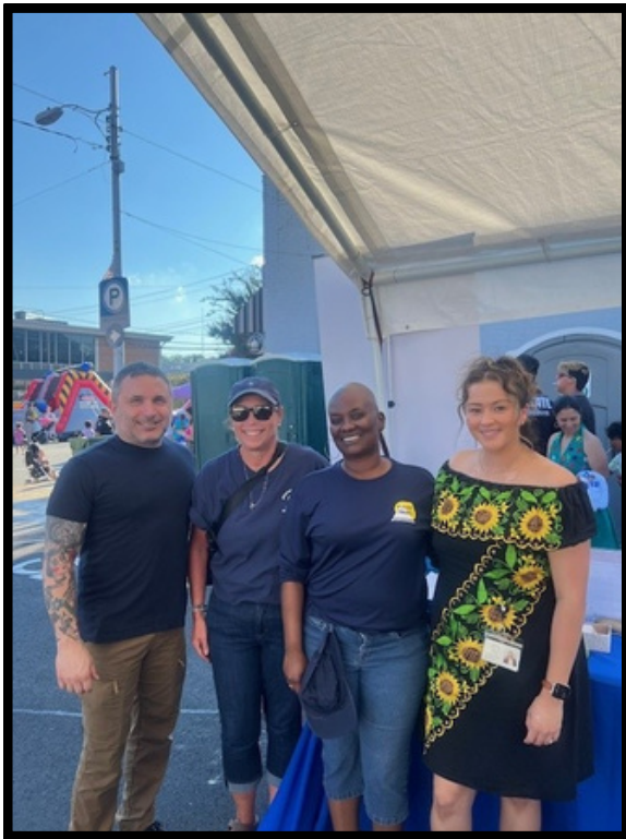
Alamance County Health Department staff at the Esperanza Hispanic Heritage Festival in September.

Staff appreciate the opportunities they have to engage with community members outside the doors of the health department and believe that this increased awareness and one-on-one education raises the likelihood that individuals will reach out to ACHD for vital services and resources in the future.